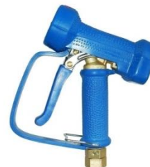
AKMNP01-B-SWM09-1/2 With ball bearing brass swivel 1/2 " female AKMNP01-B-SWM09-3/4 With ball bearing brass swivel 3/4 " female