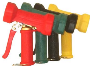
AKMN001-R red AKMN001-G green AKMN001-BL black AKMN001-Y yellow AKMN001-W white